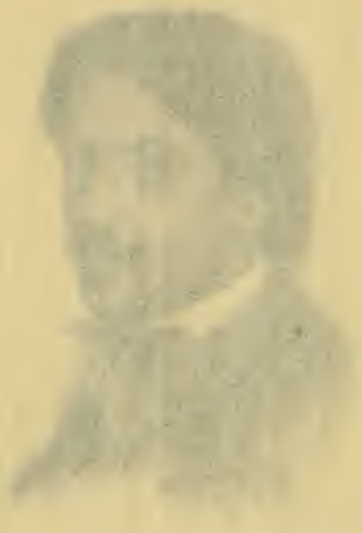
WILLIAM STANLEY BRAITHWAITE